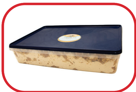
Helwa tat-Tork Walnuts