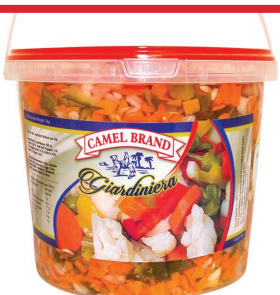
Marinated Vegetables Small