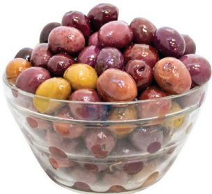
Whole Black Olives Giant