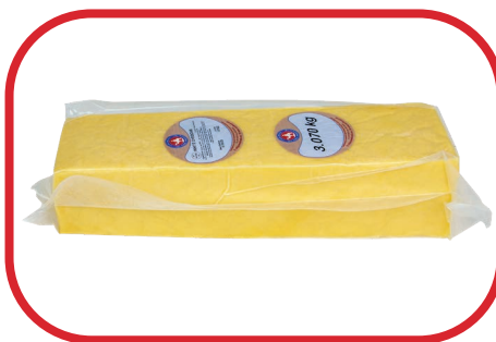
Cheddar Mature White