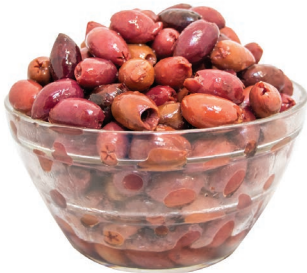
Kalamata Pitted Olives