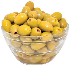
Pitted Green Olives