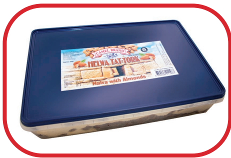
Helwa tat-Tork Almonds