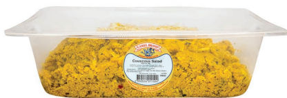
Couscous Salad Yellow