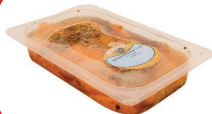
Smoked Salmon in Oil