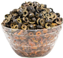
Kalamata Slice Olives