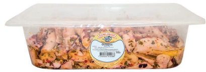
Octopus in Oil