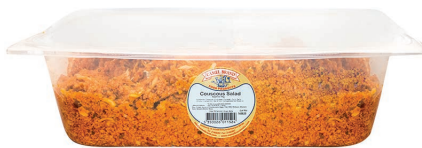
Couscous Salad Red