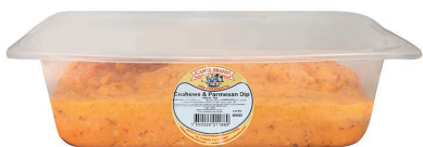
Cashew and Parmesan Dip