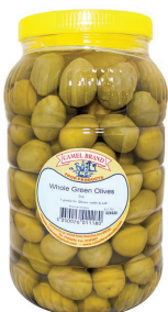
Zebbug Helu (Sweet)