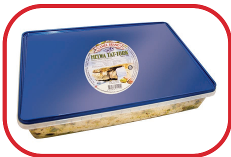
Helwa tat-Tork Pistachio