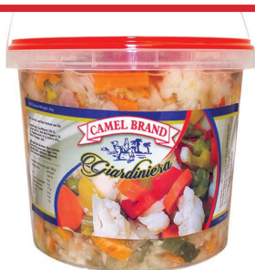
Marinated Vegetables Big