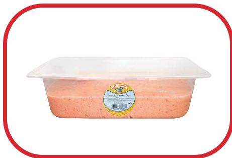
Smoked Salmon Dip