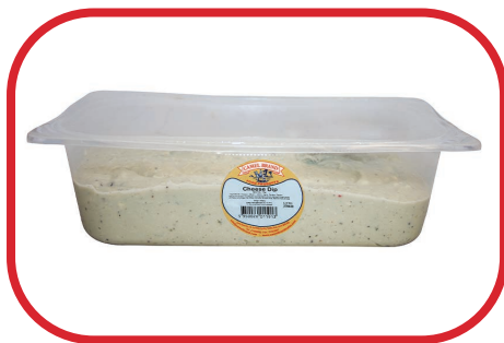
Blue Cheese Dip