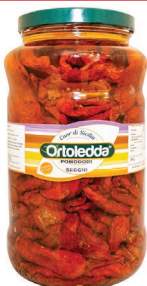
Sun Dried Tomatoes (Glass Jars)