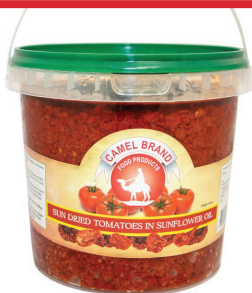
Crushed Sun Dried Tomatoes