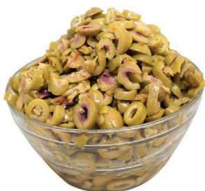
Slice Green Olives