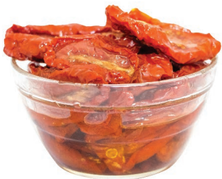
Sun Dried Tomatoes