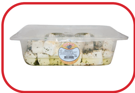
White Cheese Garlic