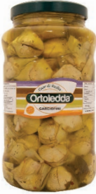
Artichoke Hearts in Oil