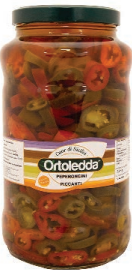
Spicy Chilli Peppers