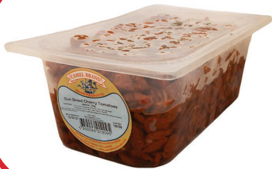
Sun Dried Cherry Tomatoes