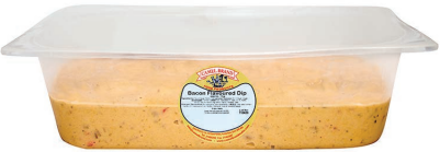
BBQ Bacon Dip