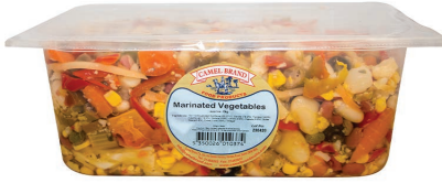
Marinated Vegetables in Oil