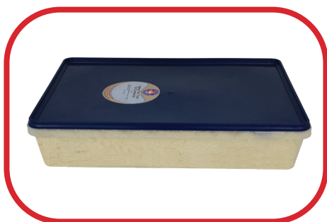
Helwa tat-Tork ta' Cinnamon