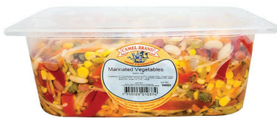
Marinated Vegetables Shredded in Oil