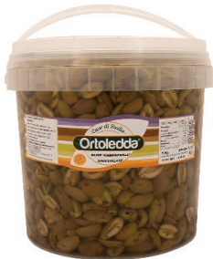
Peasant Style Pitted Olives