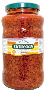
Crushed Sun Dries Tomatoes