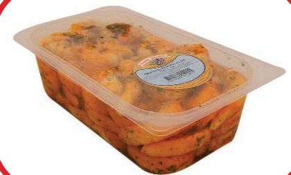
Shrimp Surimi in Oil