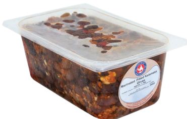
Marinated Pitted Kalamata Olives