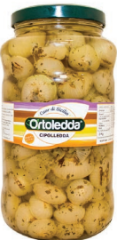
Grilled Onions in Oil (Glass Jars)