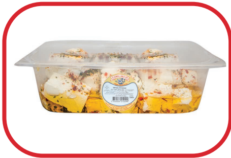
White Cheese Paprika