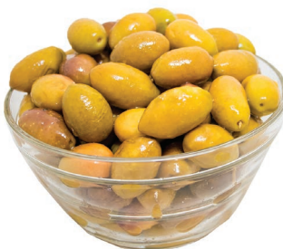
Whole Green Olives Royal (Blonde)