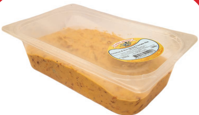
Cheese & Sun-Dried Tomato Dip