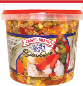
Marinated Vegetables Mixed